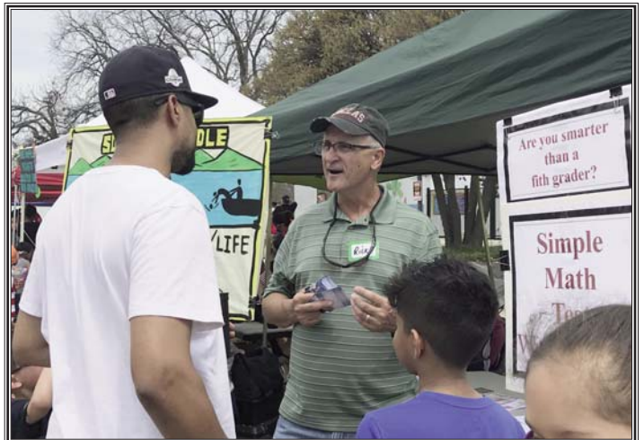
Here I am at a festival in Garland using a number game as a springboard to the Gospel.