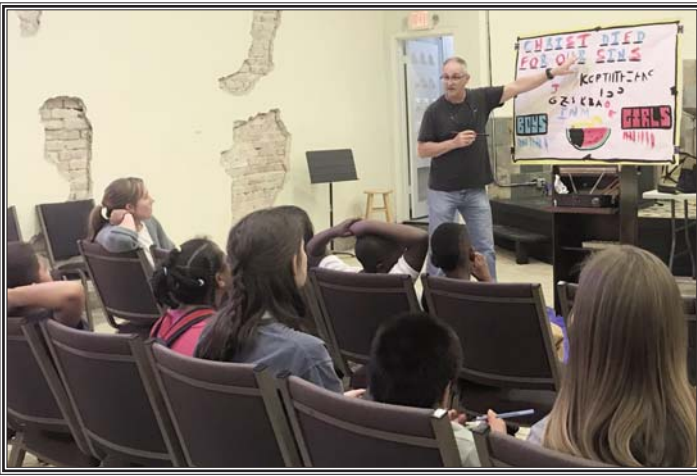
We went to Austin to work with a ministry called Mission Possible. Her I am doing a Bible verse hangman puzzle with their kid's after school group.