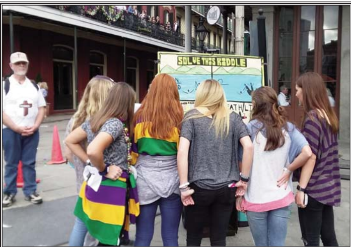
Six girls are gathered around the sketchboard in Jackson Square in New Orleans.