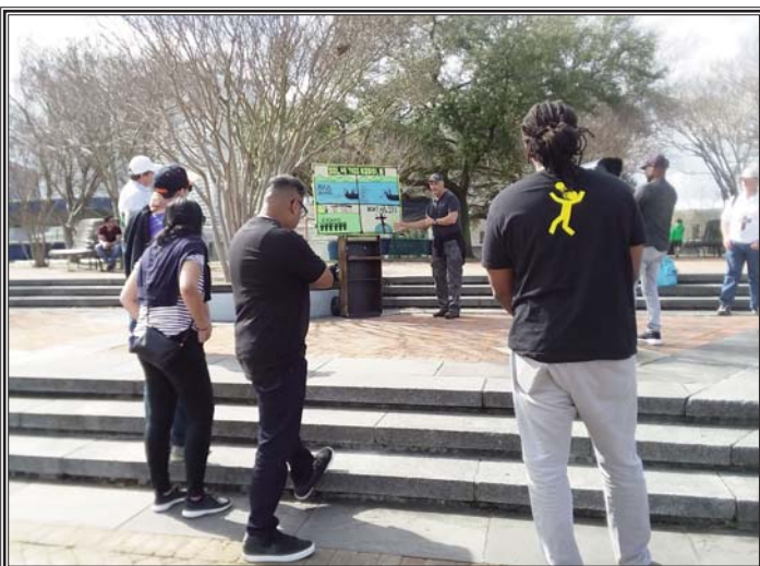
Me sharing the Gospel in a waterfront park during the day in New Orleans at Mardi Gras.