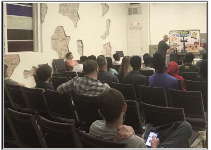
Sharing the Gospel with the youth group at Mission Possible in Austin.