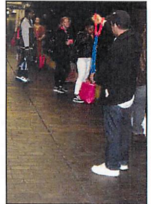
I am doing subway evangelism and giving out the Gospel using an object lesson people can relate to!

2) Also, my car was recently stolen (two days before the above-mentioned pastors' conference) see below for details, but the praise