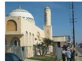
La Mirada mosque

Mosque Outreaches: I joined the Ministry to Muslims at four outreaches to three different So-Cal mosques. Basically, we wait for the people to leave their meeting and offer them free JESUS movies and Bible books in Arabic/English, with the hope that they'll stop and converse with us. At one, I had a great, heart-felt discussion with a Muslim man for about 40 minutes.