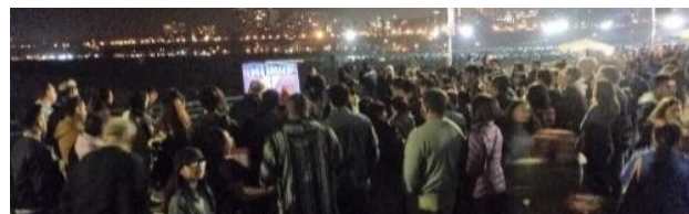
A great crowd on Santa Monica pier