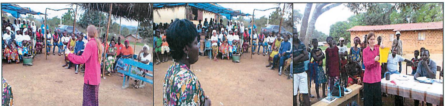
LOTS OF GOOD MINISTRY TOOK PLACE IN THE BOKOULOU VILLAGE CENTER