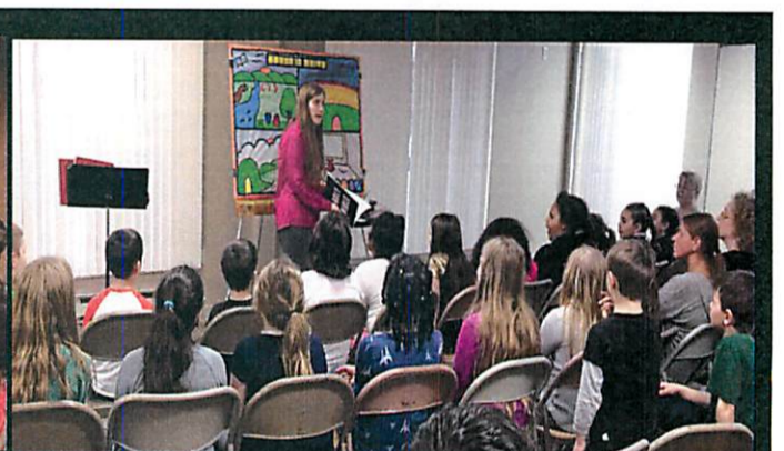
INDOOR CHILDREN'S MINISTRY OPPORTUNITIES