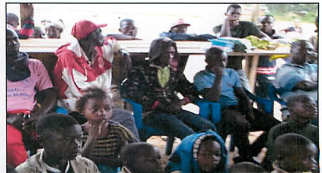
PEOPLE AT PASSY-PASSY VILLAGE (THEY CAME OUT EVEN IN THE RAIN)