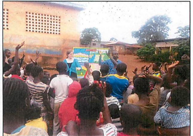
CHILDREN GATHER SPONTANEOUSLY TO HEAR THE GOSPEL

Most of this past December 2017 was spent in the Congo (Brazzaville). A team of five, myself with several local evangelists, stuffed ourselves and all my equipment in a 2002 Toyota Corolla, offroading on the red dirt byways of Congo, reaching out to remote village areas outside of Dolisie. We discovered that there is very little access to the Word of God, but many open hearts. For instance, in the village of Bolo, they had never heard the story of Abraham sacrificing Isaac, but several young men responded to the story, coming forward to receive the Lord. During our travels, we were stuck several times in the mud, and had three flat tires, but the Lord uses all for good. At one of our flat tires, we were able to share the Gospel with about 100 people who spontaneously gathered around. Additionally, a high school student in Dolisie came up to me after the message with a question: "Is Jesus God or the Son of God? I have been wondering about the deity of Jesus Christ for years." We held children's meetings in fields; groups gathered by the roadsides and waysides heard the Gospel; village centers filled with hundreds of people listened attentively. Opportunities to reach the lost and train local leaders in evangelism were endless; truly the fields are white for harvest, but the laborers are few. Continued on back