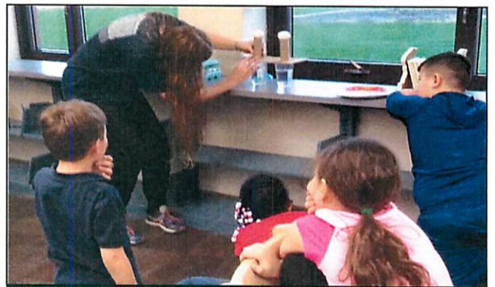
EAST ROCHESTER ELEMENTARY KIDS

Thank you so much for your continued prayers and support for my work in Open Air Campaigners!