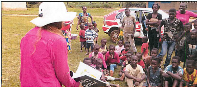
VENTURING OUT INTO IN THE FIELDS WHERE A LOT OF EVANGELISM TOOK PLACE