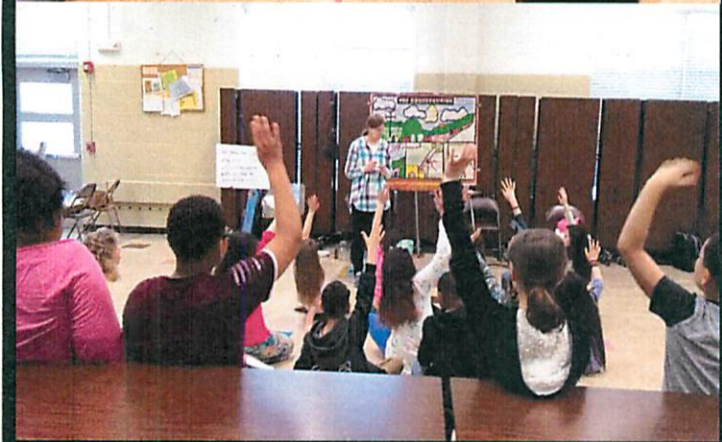
LAKESHORE ELEMENTARY KIDS