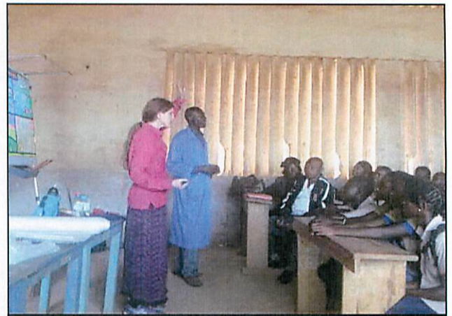
MINISTERING TO HIGH SCHOOL STUDENTS