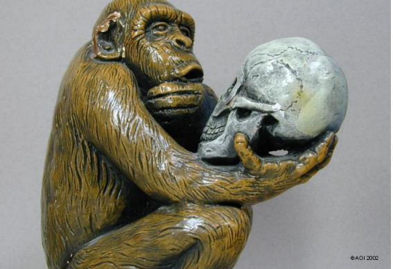
Does DNA testing reveal our ancestry and tell us since when people roamed the earth? What do the human fossils prove and can we know the purpose of our existence?