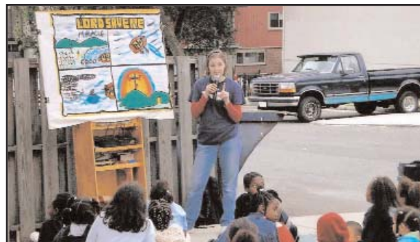
Neighborhood Childrens' Meetings

Cancellations must be received no later than May 20th. OAC reserves the right to close or cancel the seminar because of maximum (limit 25) or insufficient enrollment or any unforeseen circumstances.